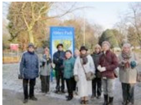
The walking group in Abbey Park

If you would like to join any of our groups, please contact the relevant leader