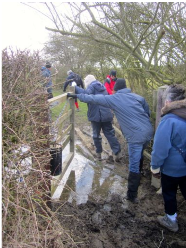
... and water swamped gateways with inventive solutions